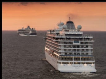
3,500 MILES BALTIC SEA CRUISE

A visit to Mike's website is really worth it especially the gallery section for more examples of his excellent work. Click here to go straight to the gallery section.