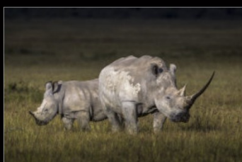
MASSAI MARA SAFARI