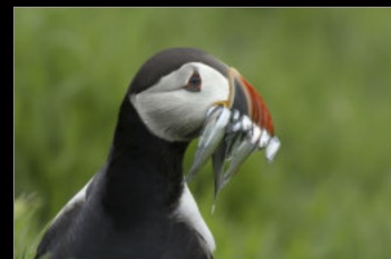
PUFFINS OF SKOMER ISLAND