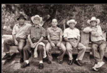
2017 COSTA RICA ADVENTURE